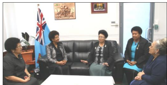
Hon. Speaker Rattle meeting Hon Speaker and some women Members of Parliament of the Fiji

Cook Islands Speaker Hon. Nikki Rattle was attached to the Fiji Parliament during the March sitting as part of efforts to review and improve Cook Islands Parliament Standing Orders and create a sustainable network of senior Parliament leaders in the Pacific. Only Cook Islands and Fiji currently have women Speakers of Parliament. Through the South-South exchange model, Hon. Nikki Rattle sat through parliament sittings and also witnessed the stages of preparation for the sittings and the roles that each unit plays.