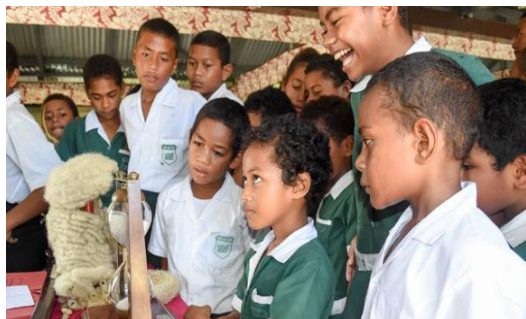
Students of Kabara Primary School listening attentively to the explanation of the Speaker's wisdom.