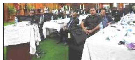
PNG Committee Chairs, Deputy Chairs & Staff listening to Hon. Netani Rika from the Fiji Parliament

In February, the Chair of the Standing Committee on Foreign Affairs and Defence was a key resource person at a training workshop for Committee Chairs and Deputy Chairs of the Papua New Guinea (PNG) National Parliament.