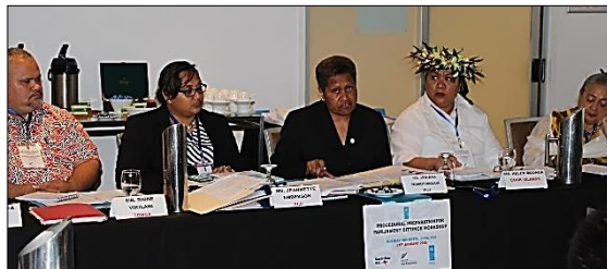
Secretary General Fiji Parliament with her Deputy, sharing good practices with regional peers

On 31 st January 2018, the Secretary General and Deputy Secretary General participated in a one-day regional workshop held in Suva for senior stakeholders from six (6) Pacific Parliaments to share information and experiences in terms of procedural preparations for Parliament sittings and resolving procedural issues when they arise during sittings.